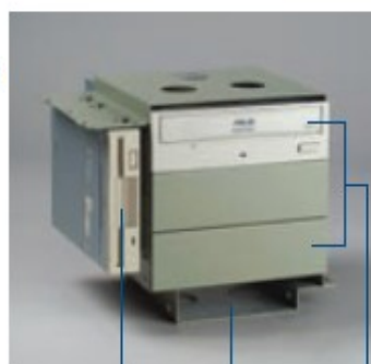
One 3.5" drive bay Three 5.25" drive bays One internal 3.5" drive bay space