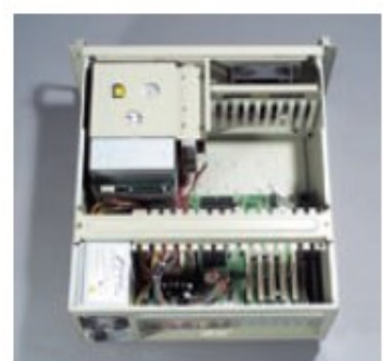
Motherboard can fit in 450 mm (17.7") depth