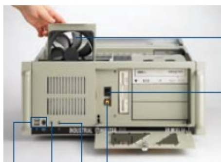
HDD LED Power button USB & PS/2 Power LED

The IPC-510 is a 19" rack mount industrial computer chassis for mission-critical applications. This unit can accommodate a 14-slot PCI/ISA bus passive backplane or a standard ATX motherboard and supports versatile power supplies. A lockable door in the front secures the unit from any unauthorized access. One hot-swap filtered cooling fan maintains positive air circulation through the whole chassis. With its hold-down clamp and shock mounted drive brackets, the IPC-510 can withstand shock, vibration and dust found in harsh environments.